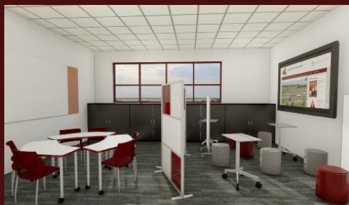
Flex Student Workspace

Additional architect renderings can be seen by visiting railroaders.net