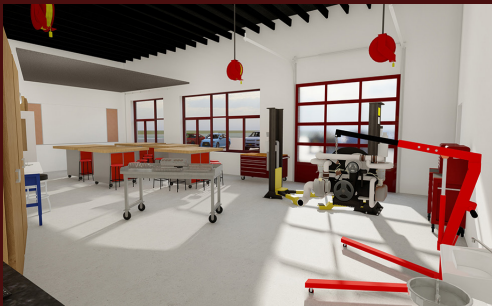
Career & Technical Education Space